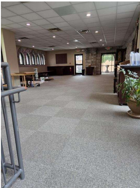
New carpet in the narthex