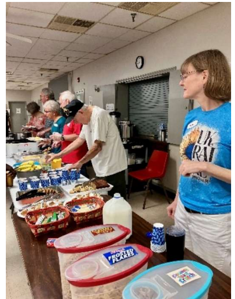
The SBC crew working the serving line