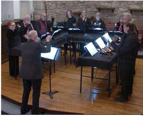
The Calvary Handbell Ensemble's annual Christmas Concert