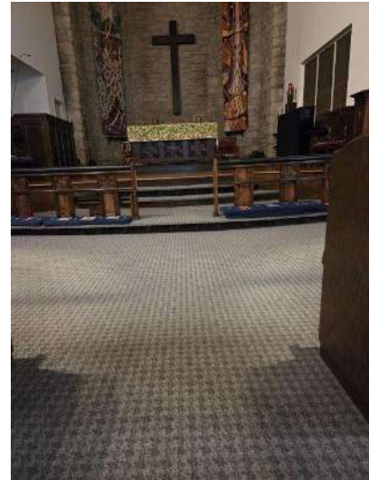
New carpet in the sanctuary