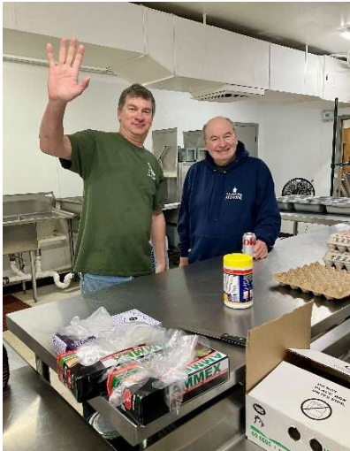
The Tims at the Saturday Breakfast Café