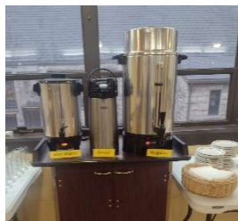
The beverage for which our fellowship hour is named

The Calvary Tech Team runs the in-house audio as well as the YouTube live stream, allowing parishioners to participate in worship even when homebound or out of town. We are always