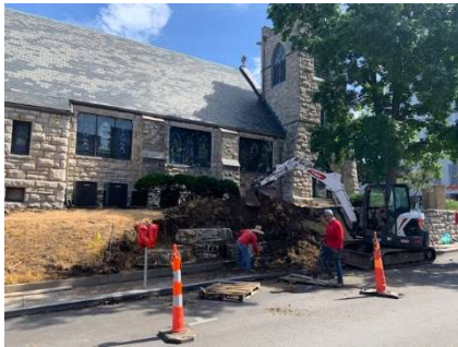
Landscaping Crew installs the new boulders on the South side of Calvary