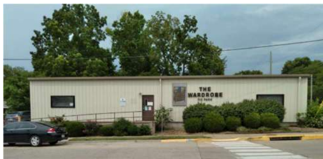
The Wardrobe, at 17 Park Ave. 65201

The Wardrobe assists some of the Boone County most “in need” residents. Calvary volunteers serve at the Wardrobe’s thrift store located on Park Avenue which offers gently used, low priced clothing, and household items obtained through donations. In 2025 the Wardrobe assisted 2,742 households with clothing and bedding; more than 4,000 children were assisted, and 875 families received coupons for discounted shoes.