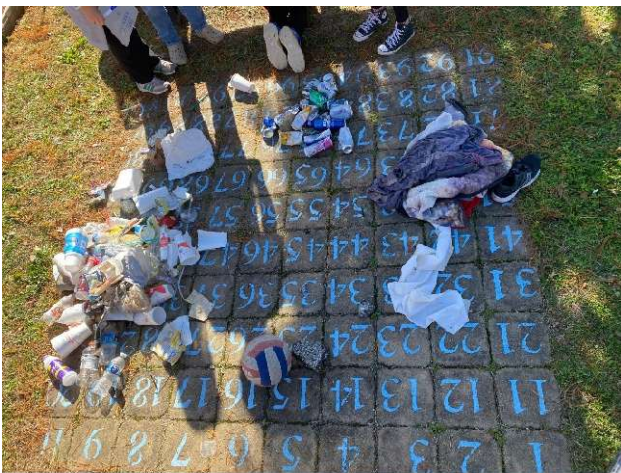
Grant students sorted and categorized stream trash on our Garden Service Day--80% plastic!