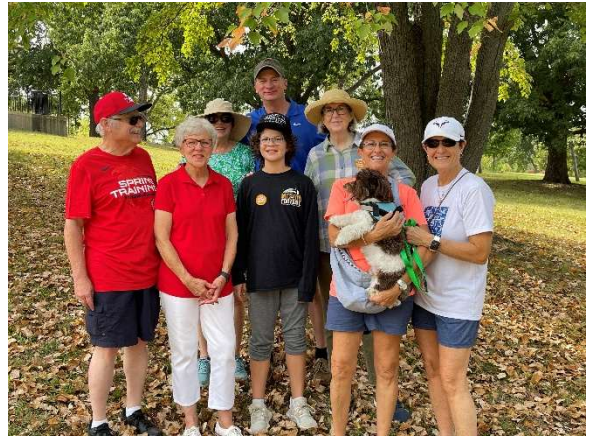
Calvary CROP Walk team 2025

Calvary walkers turned out again this September, joining organizations from across Columbia, to walk for Crop Walk, supporting programs that address issues of hunger and poverty locally and around the world. This year, Calvary raised $870. Thank you to everyone who donated or walked to support these important causes!