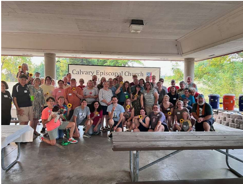
Calvary group photo at the picnic