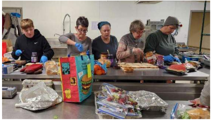
The L&F team hard at work assembling sandwiches.

The Loaves & Fishes Ministry is one of several Food Ministries for the Homeless, Needy, and Hungry of Columbia sponsored by Calvary Episcopal Church. This ministry is open to all from Calvary who would like to take part in feeding a great monthly dinner (first Sunday evening of each month) to the homeless and hungry. We routinely serve 100-130 meals, and the need in Columbia is growing.