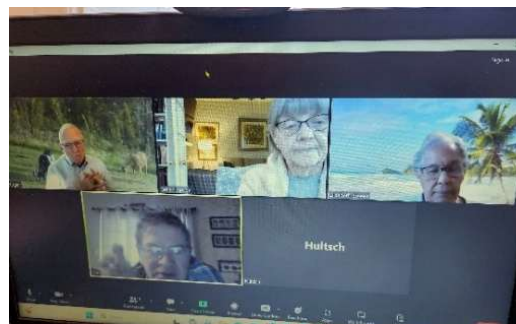
Morning Prayer over Zoom