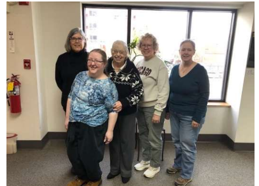
The Calvary Crafting Group

Calvary's craft group meets after the 10:30 AM service to socialize and share our crafts with each other. We have a number of knitters and crocheters, but all crafts are welcome.