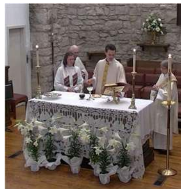
The Altar with Easter lilies