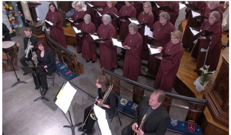
Brass and Timpani join the Calvary Cambridge Choir during the Easter Sunday offertory anthem