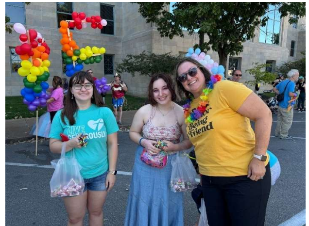
ELFY at the 2025 Pride Parade