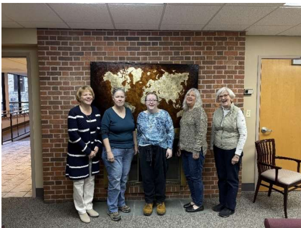
Calvary's Chapter of The Order of the Daughters of the King