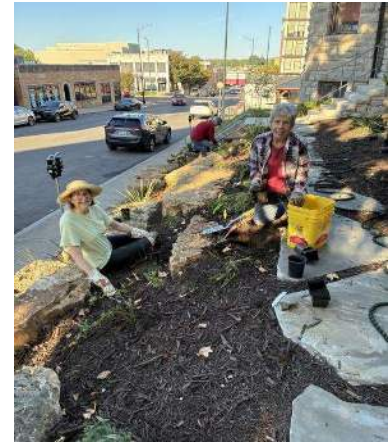
Calvary Parishioners plant native MO plants in the South Side lawn