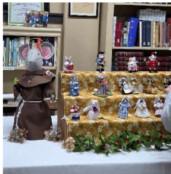
Church Mice for sale!

The annual bazaar, held on the first Saturday of Advent, was very successful this past year (Dec. 6), with more than $15,000 raised in a four-hour period. Our selected agencies this year were City of Refuge, Central Missouri Community Action, Tags of Hope, MedZou, Day Dreams Foundation, and Food Not Bombs. We are holding a debriefing after the 10:30 service on Feb. 15, and the committee will begin plans for the 2026 edition in April.