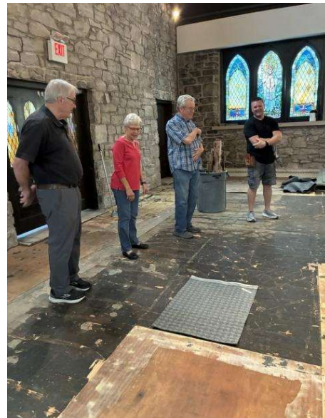
Calvary Parishioners get a preview of the new carpet in the sanctuary